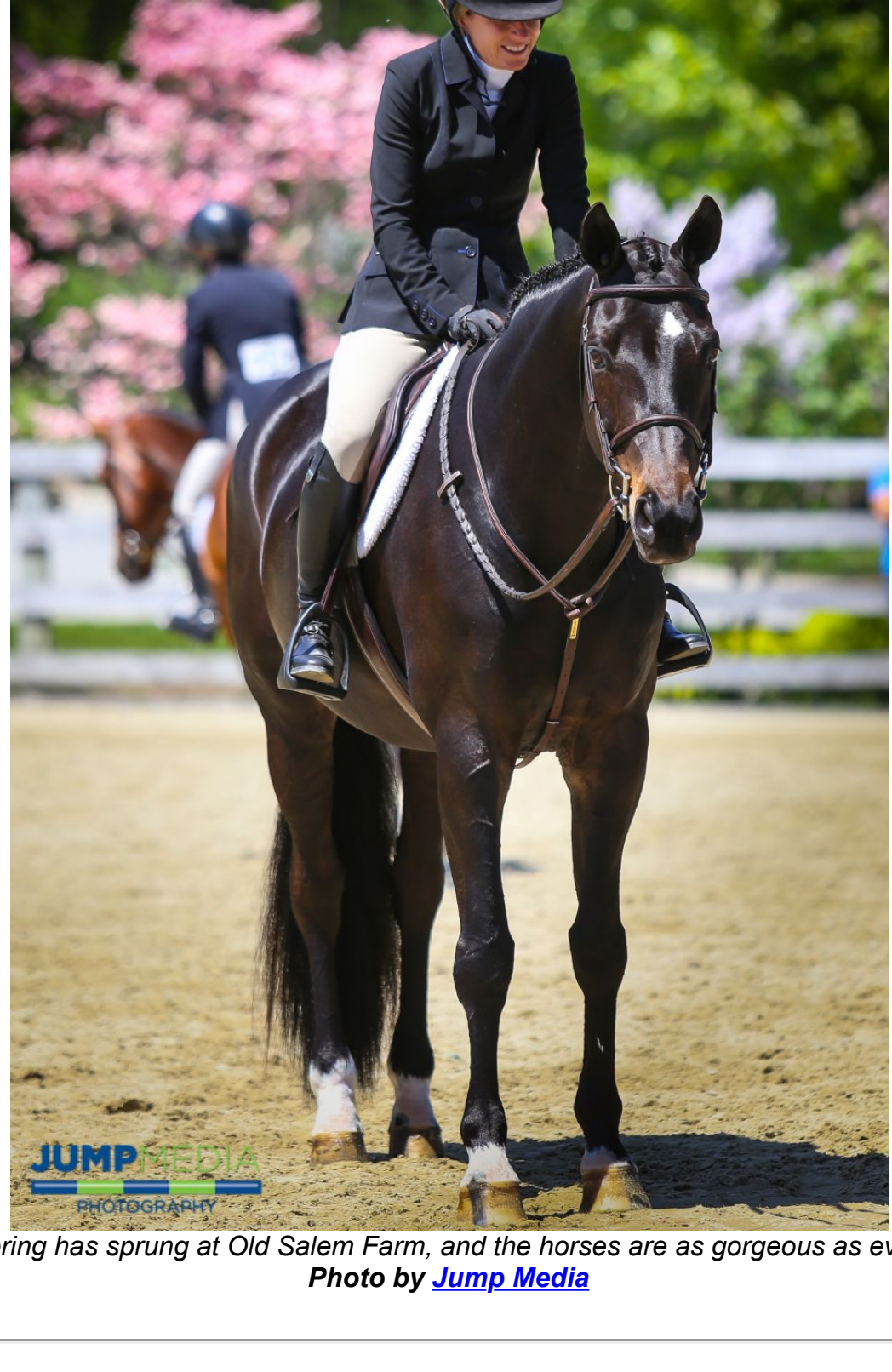
Spring has sprung at Old Salem Farm, and the horses are as gorgeous as ever!